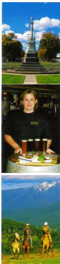
The police memorial (top), the tasting plate at Jamieson Brewery (centre) and getting around on horseback (above).

Victoria's High Country is aptly named, because it can produce a heady mix of adventure, history, scenic splendour and total indulgence. Susan Gough Henly uses its 'capital' as a base for a high old time